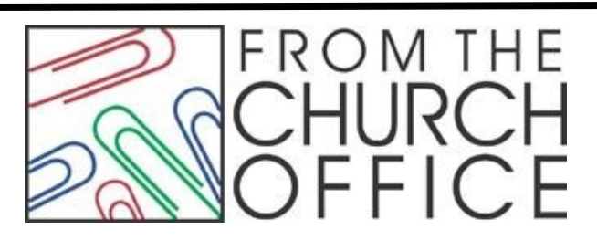
Please call the Church Office . . .

Information should be given to the church office.